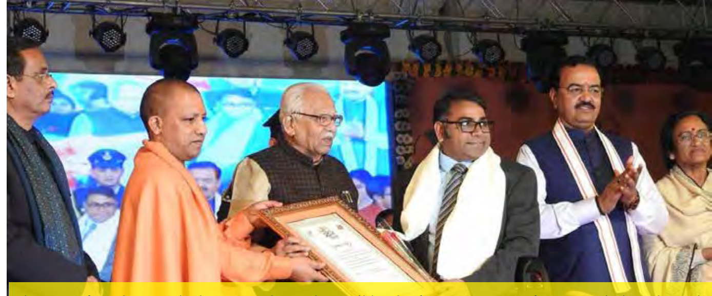
Photo: Prof Varshney with Shri Yogi Adiyanath, Hon'ble Chief Minister, State of Uttar Pradesh, India and Shri Ram Naik, the then Hon'ble Governor, State of Uttar Pradesh – January 2018. Received Certificate and Honour for Outstanding Science Contribution - 2018 by Uttar Pradesh Government in January 2018