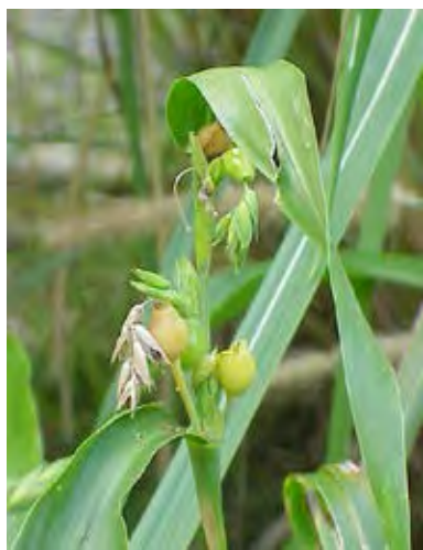
Photo: Job's tears Plant